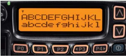
Two line setting display example.

With a high contrast dot matrix display, upper and lower case characters can be easily distinguished. You can change the display setting to show one line and 12 characters, or two lines and 24 characters via programming. LCD backlighting is useful for night time operation.